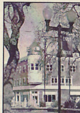
Downtown Paso Robles.

Explore the local wineries, visit the hills of the quicksilver range or drive to the coast and have a pasty lunch at the Tea Cozy shop in Cambria (see page 7 for details). Also, see additional information provided in your registration packet.