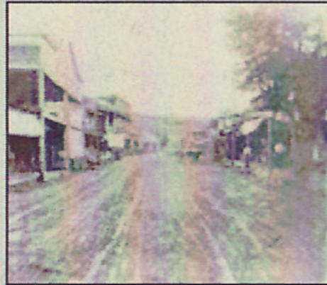
Placerville, CA circa 1866.

□ The CCC Gathering for 2011 will be held in the gold rush-era town of Placerville on the weekend of June 3 -5. Placerville sits in a little valley straddling Hwy 50, about half way between Sacramento and South Lake Tahoe. It didn't take long after the discovery of gold in the tailrace at Sutter's Mill in Coloma for hopeful miners to be found digging holes all over the Sierra Nevada foothills. The town now known as Placerville was established in the Spring of 1848 and was originally called Old Dry Diggins, because miners had to cart the dry soil down to the creek to wash the gold out. Within months though, the wild and virtually lawless town had become known as Hangtown, due to the citizen's complete lack of patience with the murderers, thieves and card-sharps who had come to town to prey upon the hard-working miners.