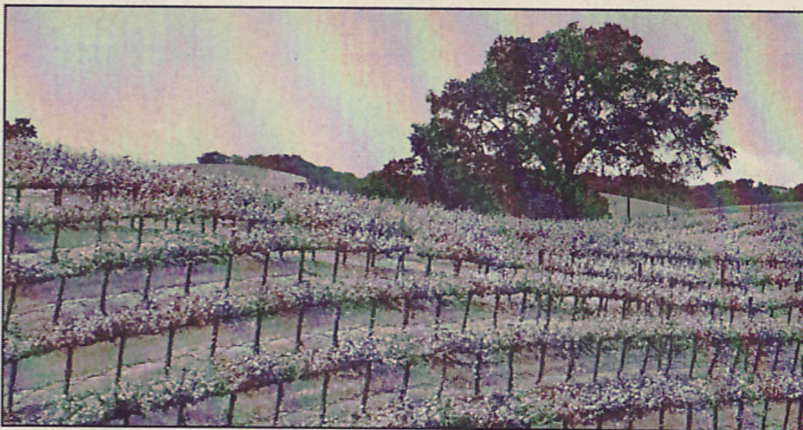
The Paso Robles wine country beckons.